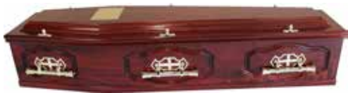
Windsor – Semi-Solid Mahogany (also available in Oak) £720