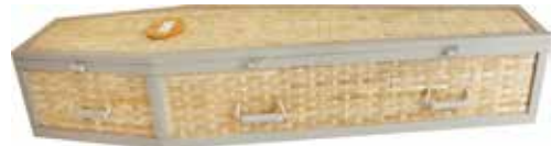
Premium Bamboo* £720